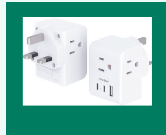
power plug travel adapters